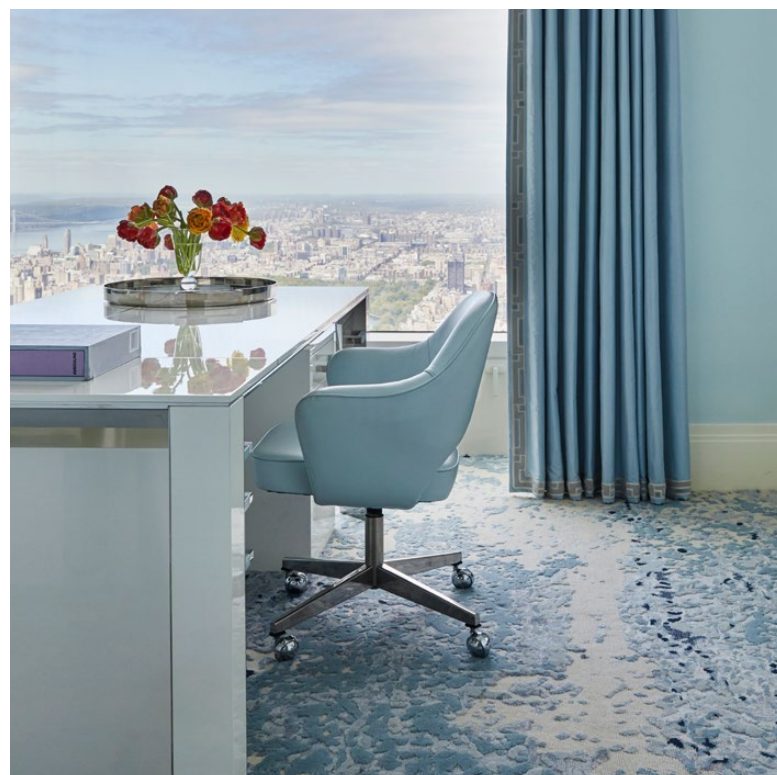
The all-blue home office showcases high-gloss walls, wall-to-wall Stark carpet and blue taffeta drapery. A custom desk by Lorin Marsh is paired with a vintage Saanen Executive chair.