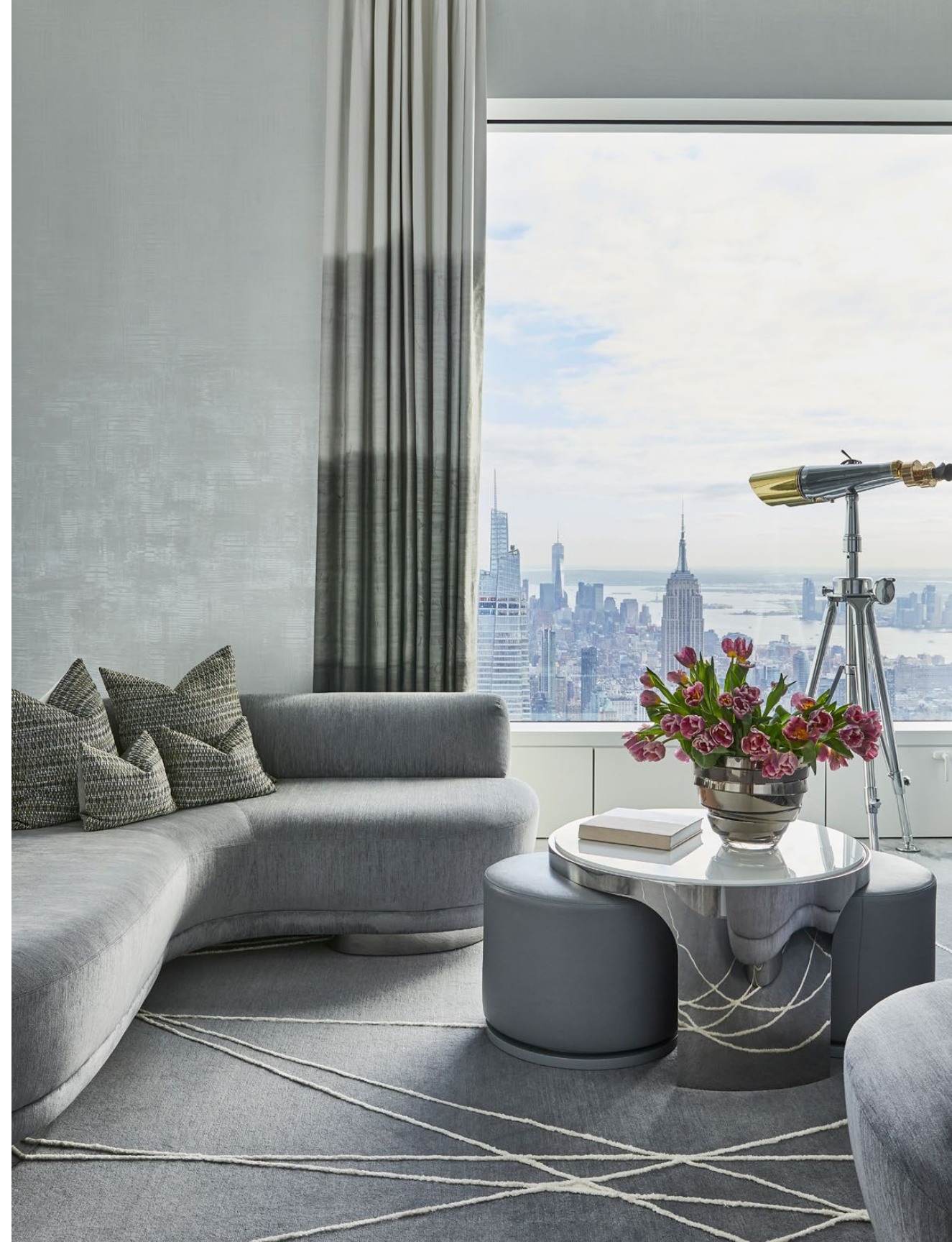
This lounge area is an extension of the breakfast room and features vintage long-range observation binoculars, creating a lookout point for the city beyond

“ In a city that often feels strapped for space, much of the luxurious feel that emanates from this home comes from the grand scale of each room, as well as the oversized windows . ”