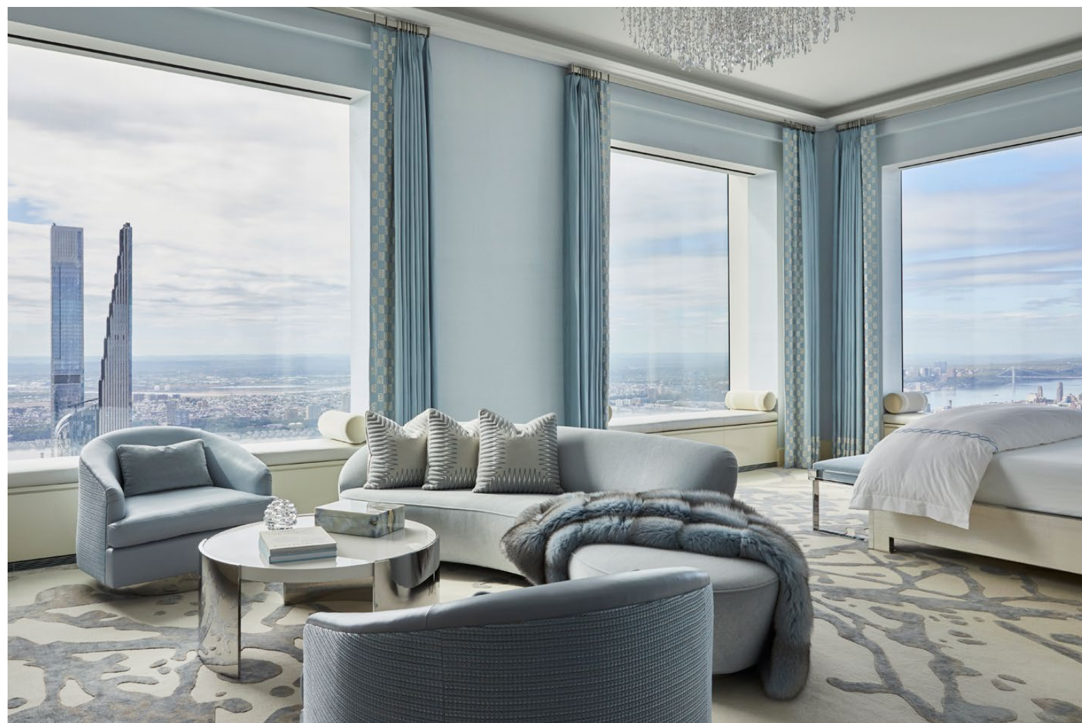
The primary bedroom sits at the corner of the building, featuring panoramic views from the three oversized windows. The curved Vladimir Kagan furniture and custom swivel chairs and coffee table make up the seating area of the bedroom.